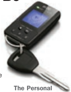
The Personal Pocket GPS Locator by ecco™

IN LAUNCHING ITS PERSONAL Pocket GPS Locator, ecco™ has presented the world's smallest key fob GPS locator. Able to store up to three locations, it is powered by a rechargeable battery and can track distance of up to 10,000 miles and up to 30 satellites within 60 seconds. There is no software required, no service fees charged. Featuring a highly sensitive GPS system with superior performance capabilities plus 3-axis compass and 3-axis accelerometer, the Locator is convenient and simple to use — just lock, go and return — and an ideal accessory for seniors, adults and children alike. MSRP $100. For more information, contact 718-338-0177 or George@Earthgear.org.