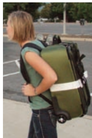
The Monkey Strap™

INSPIRED BY TANDEM SKYDIVING IN LAS VEGAS, the Monkey Strap™ is a luggage accessory that converts any carry-on suitcase to a backpack. Made of the highest quality machine washable materials