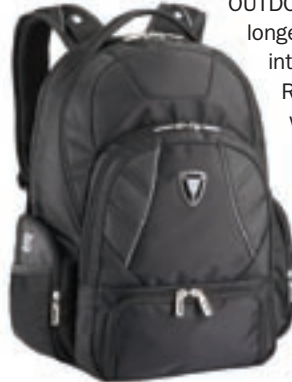
The Full Speed Rain Control Backpack by Sumdex is available in black.

OUTDOOR ELEMENTS ARE NO longer a concern: Sumdex Inc. introduces the Full Speed Rain Control Backpack with its featured hidden "Rain Mask" for protection from moisture. Designed for 15.6" notebook computers, the top loading padded computer cradle uses an anti-scratch velvet lining and securing strap for maximum protection. A multi-functional workstation compartment stream-