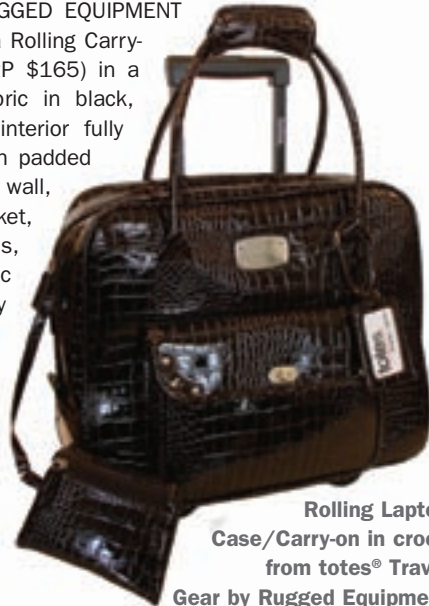
Rolling Laptop Case/Carry-on in croco from totes® Travel Gear by Rugged Equipment

totes® TRAVEL GEAR BY RUGGED EQUIPMENT gets down to business with a Rolling Carry-on with Laptop Sleeve (MSRP $165) in a feminine crinkled patent fabric in black, merlot and brown and an interior fully lined in a floral pattern. With padded laptop pocket on interior back wall, front gusseted accessory pocket, easy glide in-line skate wheels, push-button locking telescopic handle and interior accessory pockets, this case is as competent as its user. totes' Rolling Laptop Case/Carry-on has these same features, in glossy black or bronze croco fabric, plus a zippered pouch with string. MSRP $165. Call Tom Heckelmann at 212-268-8172 for more information and full catalog.