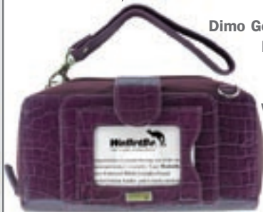
Dimo Gear LLC/WalletBe's Double-Wide Cell Phone Accordion Wallet-Purse

DIMO GEAR LLC/WALLETBE RECENTLY LAUNCHED A DOUBLE-WIDE CELL Phone Accordion Wallet-Purse for always-in-motion moms and working women. A compact Italian leather zip wallet and cell phone holder, it is small enough to fit in a handbag, but works even better as a cross-body bag or stylish wristlet. Inside, the wallet features 12 individual accordion slots for easy access to credit cards, an elastic pouch for cash and a large outer zippered coin purse, gusseted for extra room — there's even an inner slot for a tube of lipstick and a small pen. Outside, the wallet has an accessible ID with a hidden curtain. Available in six colors, the leather is croco-embossed, two-toned and hand finished, just the little luxury that makes Mom feel special. MSRP $42.95. For more information, call 916-684-1051, email Matt@walletbe.com or visit www.walletbe.com.