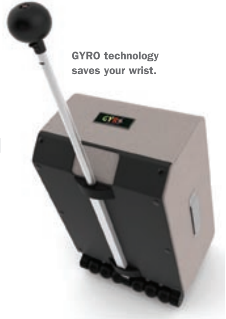
GYRO technology saves your wrist.