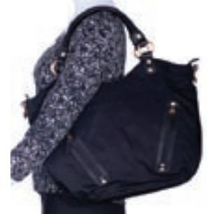
Ellington's Mia Tote

ELLINGTON HANDBAGS RAISES THE STRAP WITH ITS Mia Tote, a versatile carryall with sophisticated style that moves effortlessly yet chicly from work to travel to everyday use. Featuring soft yet durable washed nylon twill with glazed goat leather trim and brushed gold-finish hardware, this black beauty has a roomy logo-print lined interior with one large slip pocket, two small slip pockets, a large leather-framed zip pocket and a key clip, plus two angled zip pockets on the front of the bag and removable leather logo keychain. Mia may be carried by shoulder straps or its detachable and adjustable canvas cross-body strap. MSRP $99. For more information, contact Amanda Carter at 503-223-7457 x-110 or amanda@ellingtonhandbags.com or visit ellingtonhandbags.com.