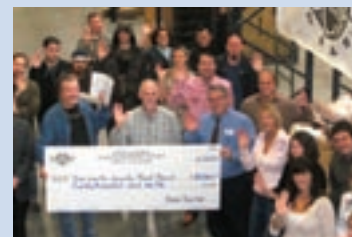
Eagle Creek and North County Community Service associates celebrate success at Eagle Creek's 2009 food drive weigh-in.