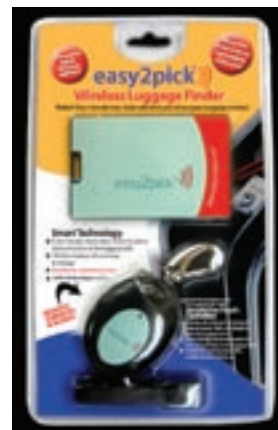
The Easy 2 Pick Wireless Luggage Finder ends the scavenger hunt at the baggage carousel.

The Easy 2 Pick consists of a luggage tag transmitter and matching key fob-like receiver. When you activate the receiver it flashes, beeps and vibrates when your bag gets within 60 feet so