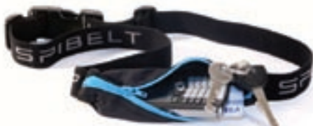
The SPIbelt is the ultra-minimalist fanny bag.

In addition to the signature SPIbelt, there's the Solo Pocket which attaches to any belt and provides the same small-item carrying capacity, like a passport wallet you wear around your waist.