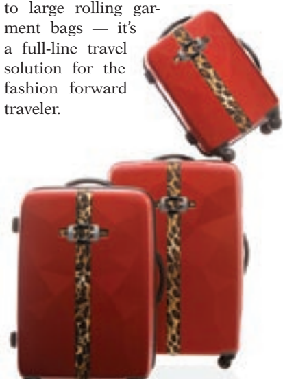
Guess Travel offers customers fashion luggage with a brand they trust.

Guess Travel's lineup runs the gamut from cosmetic travel cases to large rolling garment bags — it's a full-line travel solution for the fashion forward traveler.