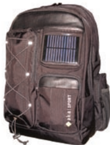
Topzip's philosophy of building a backpack outward, starting from the wearer's back, helps give it top-level fit and carrying comfort, while the patented solar array lets travelers charge cell phones and MP3 players on the go.

Topzip aims to relieve a little of this electronic stress with its signature item, a sub-$100 solar backpack